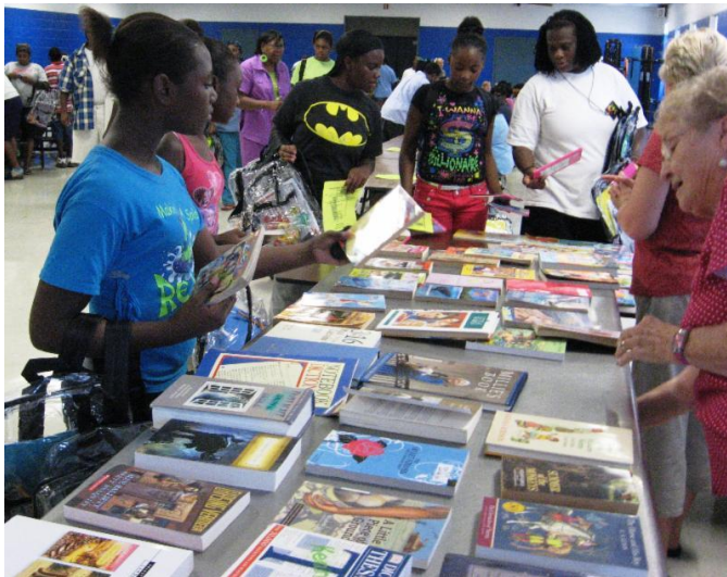
Book Table at Bags of Hope

Our annual school supply drive for the children of Lake Providence