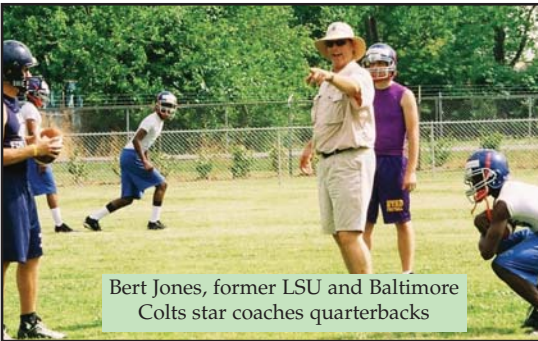
Bert Jones, former LSU and Baltimore Colts star coaches quarterbacks