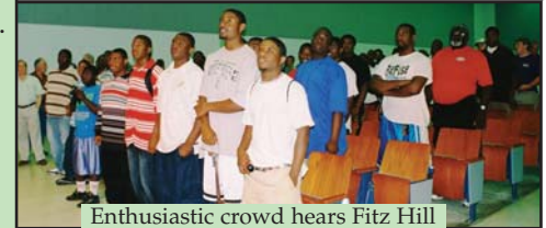
Enthusiastic crowd hears Fitz Hill