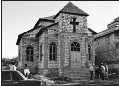
Members of Bethlehem Church in front of their soon to be completed building.

After 5 years of valiant struggle, Bethlehem Baptist Church, a Gypsy congregation, in Vulcanesti, Moldova will soon have a building for the first time through a partnership with CBF-LA.